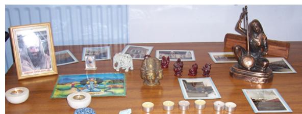
Display of some items that might be found in a Sikh home shrine