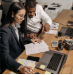
Schools forum report April 2025