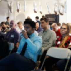
Ealing school governor recruitment event