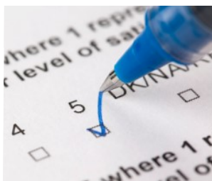
Pre & post surveys