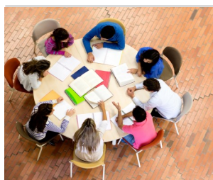
A parent workshop