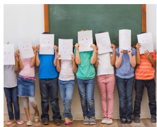
2 modelled RSE lessons