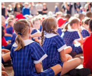
A pupil assembly