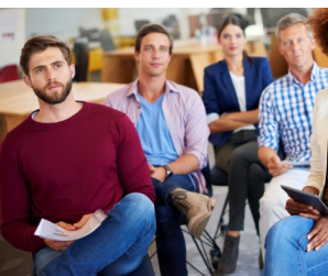
8 central nutrition & exercise trainings