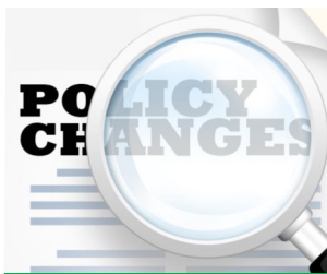
Review of food and exercise policies

*Initiatives include The Daily Mile, 3 minute HIT (High Intensity Training), token reward system, Playground Zones, school fun run, active learning, health champions and health fair.