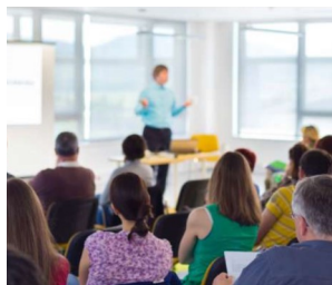
Staff training on RSE