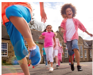
4 initiatives from a choice of 8*