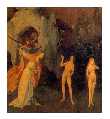
Detail of "Hay Wain" triptych by Hieronymus Bosch